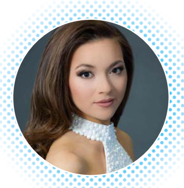
15 ALUMNI SPOTLIGHT